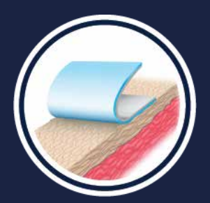
Atraumatic Silicone Coating Reduced pain during application and dressing changes

Silflex is an atraumatic wound contact layer dressing made from polyester mesh coated on both sides with Silfix soft silicone.