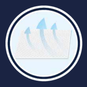
High Exudate Transfer

Does not adhere to the wound bed or secondary dressing